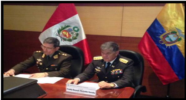
MEETING BETWEEN NATIONAL MINE ACTION AUTHORITIES