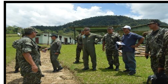
RECONNAISSANCE OF THE AREAS OF OPERATOINS