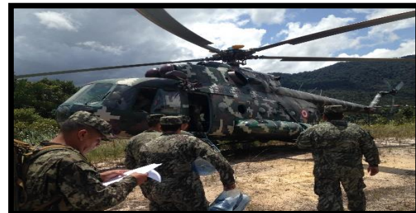
INITIATION OF DEMINING OPERATION ON BORDER AREAS NICO OPNS DESMINADO FRONTERA TERRESTRE