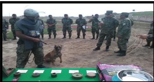
RETRAINING OF HUMANITARIAN DEMINING PERSONNEL