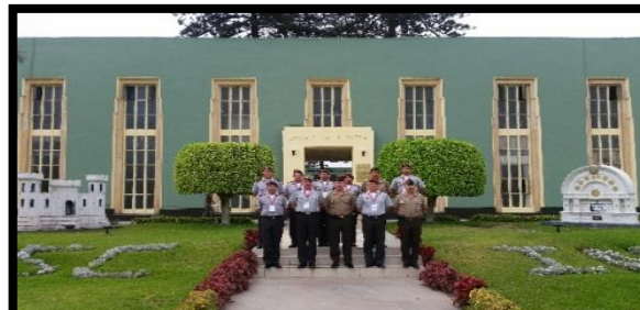
JOINT PLANNING PERU - ECUADOR