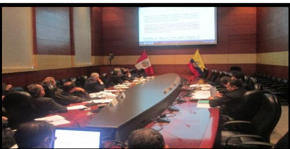
COORDINATION MEETINGS – MINISTRE OF FOREIGN AFFAIRS