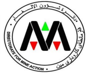
Field Survey of Victims in Anbar Province / Haditha & Faluja District 11/12/2017 - 30/3/2018