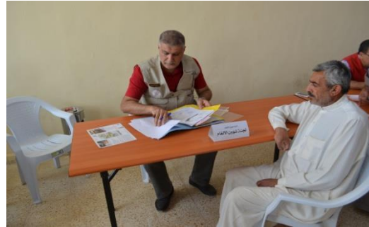
2.Mine action committee