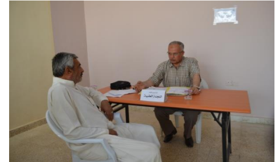
3. medical committee