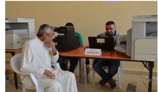
6.Identity Issuing Committee