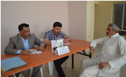
4.Social work committee