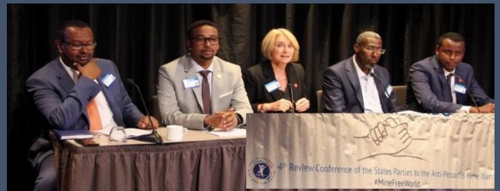
Photo above (l-r), Director General of the Ministry of Women and Human Rights Development Deeq S. Yusuf; Deputy Minister of Somalia’s Internal Security H.E. Abdinasir Said Muse; UNMAS Director Agnes Marcaillou; SEMA Director Dahir A Abdulle; and, Hussain I. Ahmed UNMAS Somalia.

In the margins of the Review Conference, the Government of Somalia presented the draft Somali Disability and Victim Assistance National Action Plan which will now go on consultations with relevant stakeholders. The Plan was developed with support of various stakeholders including UNMAS, and received vast input from national stakeholders. It seeks to integrate VA efforts in wider disability rights contexts under the Convention of the States Parties to the Rights of Persons with Disabilities (CRPD).