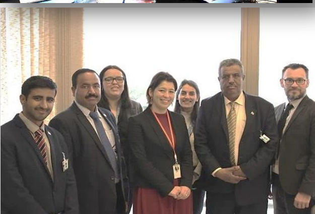
Photo above, on the margings of the National Directors Meeting in Geneva, the delegaton of Yemen met with the Committee on Article 5 Implementation and ISU.