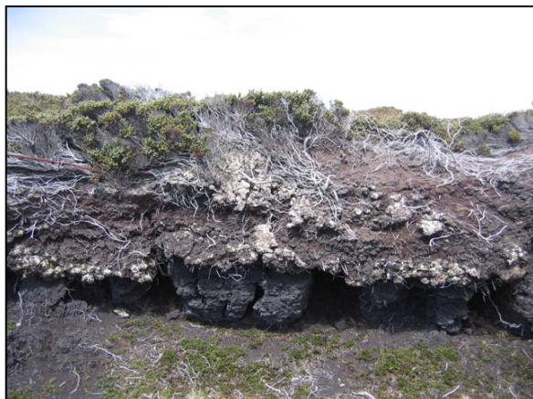
Under mature Empetrum / diddle-dee vegetation, the dry surface layer of this old peat bank consists of a slab of firm, resistant fibrous peat, overlying less resistant humidified peat, near Minefield 52.