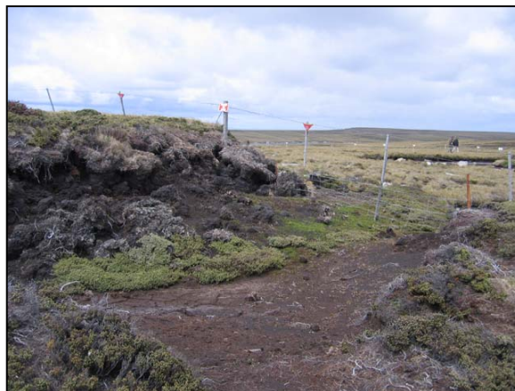
An eroding peat bank on the edge of Minefield 36; blocks of peat have cascaded down the scarp and in the right middle distance there is a hollow filled with soft humidified peat.