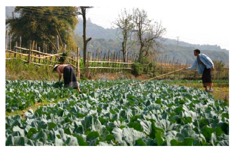
Linking Mine Action with Development in Lao PDR: Demining supported by the DDPS, agricultural extension for the use of the cleared fields supported by SDC

Switzerland's co-ordination mechanisms for mine action follow the principles of a whole of government approach. It functions well and will be