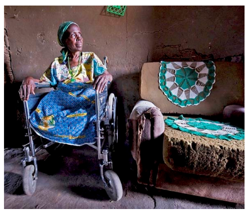
Landmine Victim, DRC