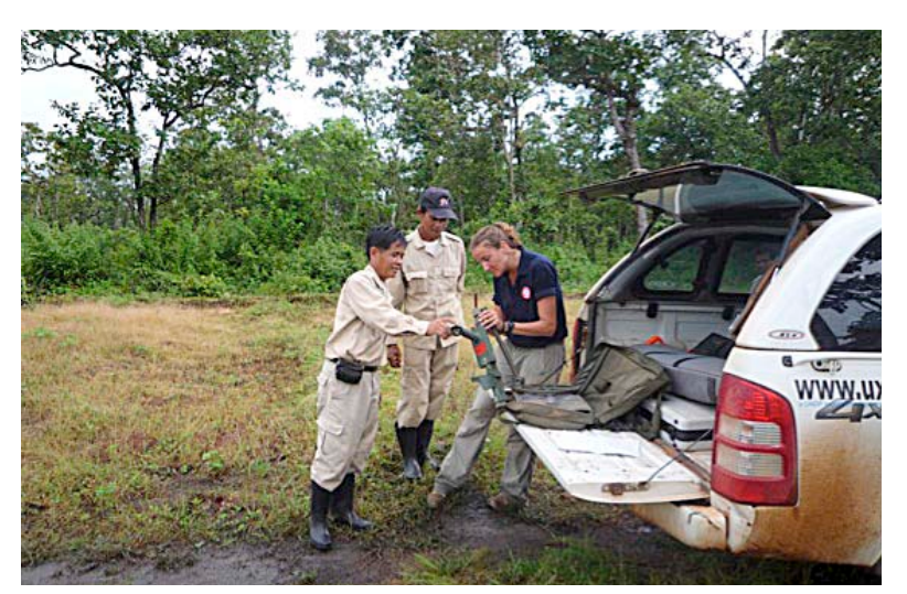
Quality management by an expert of the Swiss Armed Forces in Lao PDR

Switzerland strives to remain a constructive, critical and reliant donor, with close relationships to its partners, as well as with the capacity to act quickly and to tackle difficult questions.