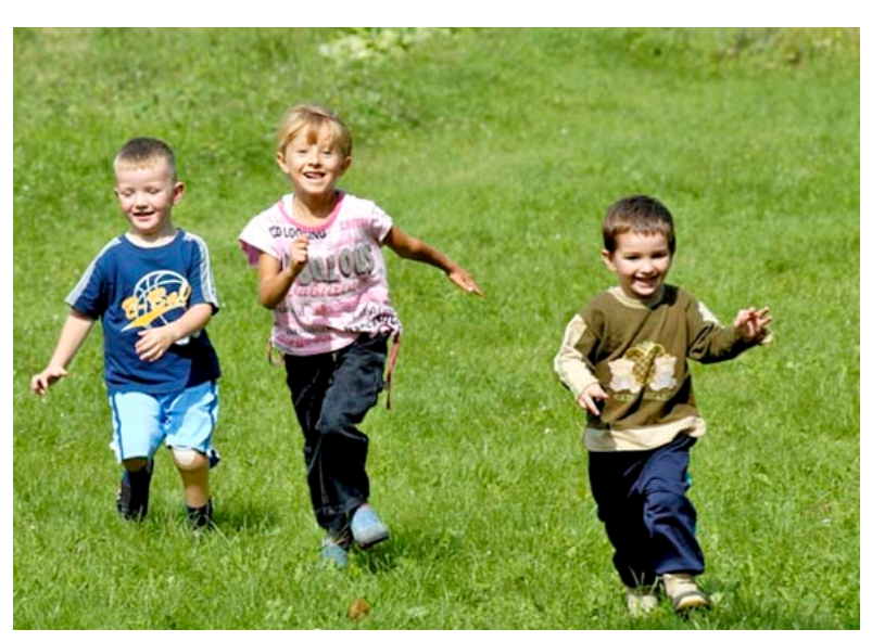
With friends again, Landmine Survivors Initiatives

An external evaluation of this strategy, led by FDFA, will be concluded by the end of 2014 at the latest in order to include the relevant recommendations in the development of the next revised strategy.