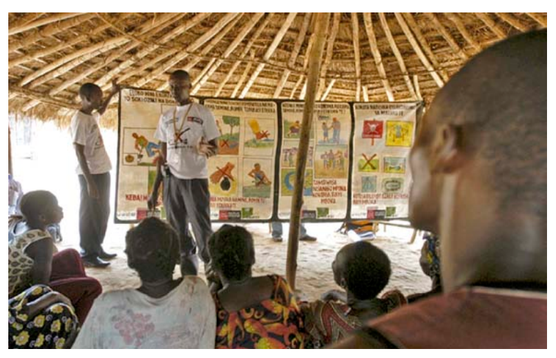
Mine Risk Education Training in DRC

Furthermore, specific contributions are provided to the International Campaign to Ban Landmines / the Cluster Munitions Coalition / the Monitor (ICBL, CMC, the Monitor), GMAP Association and to Geneva Call, as a strategic partner.