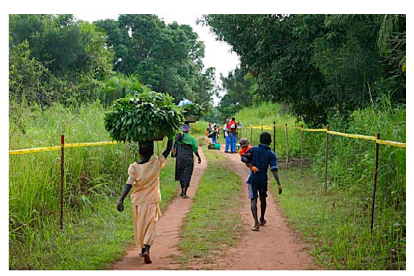
Cleared road in unsafe environment

There were two serious allegations of the use of cluster munitions in 2011. As a result of unreported cases, the number of victims of mines, cluster munitions und ERW reported to be 17'000 up to the end of 2010 is almost certainly too low.