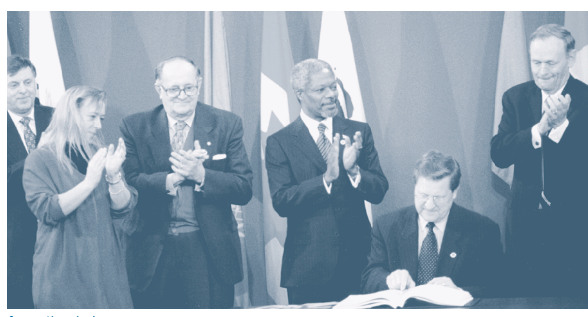
Convention signing ceremony | Ottawa | 3 December 1997

Needs of survivors have been addressed for the first time in a disarmament/arms control convention. Most of the 26 States Parties reporting the responsibility for significant numbers of survivors have engaged in a process of developing objectives and a plan of action to meet the needs and guarantee the rights of landmine survivors and other persons with disabilities.