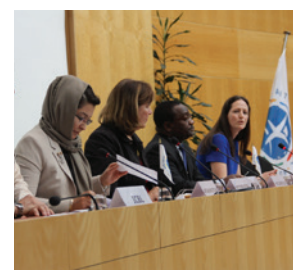
Thematic panel discussion on building political will to achieve mine clearance completion by 2025 led by Canada, Intersessional Meetings, 20 May 2016.

The integration of gender in mine action is not only about equality, but also about quality of government action and the level of fulfilment of its international