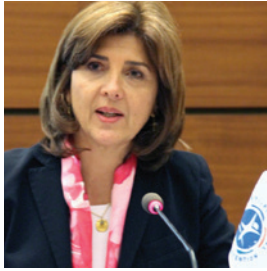
Minister of Foreign Affairs of Colombia, H.E. María Ángela Holguín