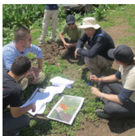
Non-technical survey being conducted in Tajikistan.

During this panel, participants will have the opportunity to learn about key aspects of gender considerations in mine action and will have the opportunity to learn from States on how integrating gender consideration into their mine action activities has had positive effects on their programmes. Representatives from affected and donor states will lead discussions on this issue.