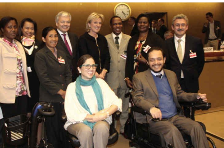
Photo above, left: HRH Princess Astrid of Belgium and Minister of Foreign Affairs of Belgium H.E. Didier Reynders led a disability rights panel during the Fourteenth Meeting of States Parties.