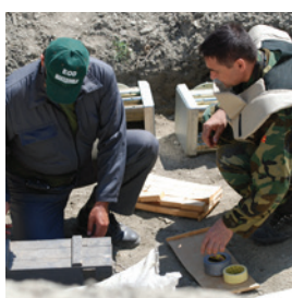
3: Belarus, Greece, Oman, Poland and Ukraine.