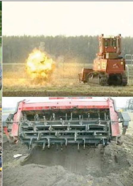
Test of civil/mil mechanical demining equipment