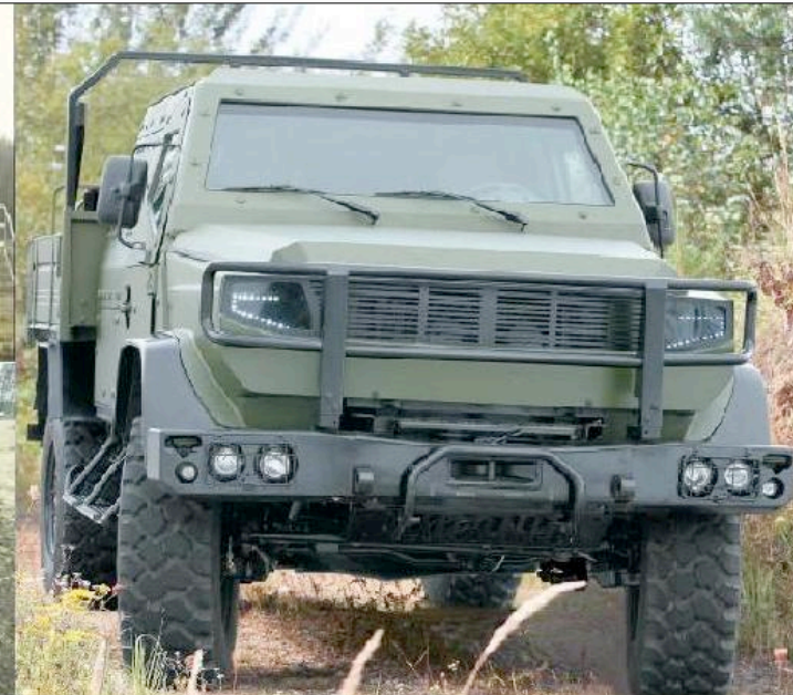
Protection for lightly armoured vehicles - research