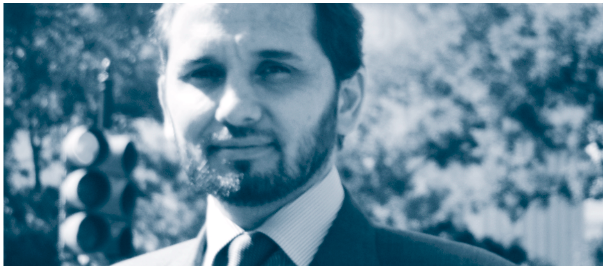
The President's Special Envoy on the Universalisation of the Convention, His Royal Highness Prince Mired of Jordan, will report to the 10MSP on his activities