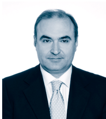
Edmond Haxhinasto | Minister of Foreign Affairs of Albania