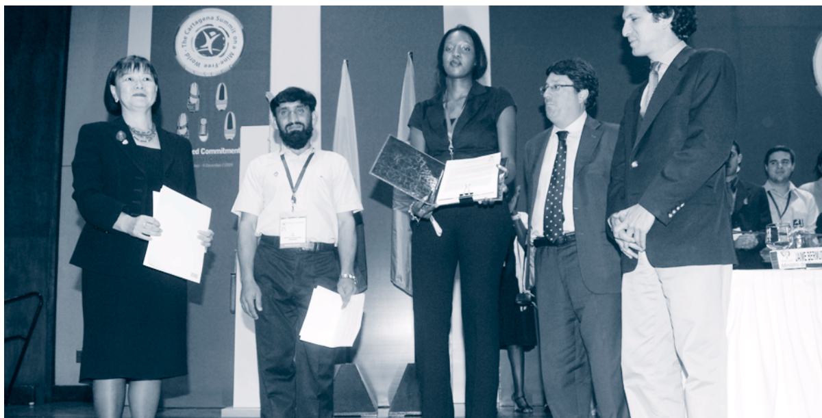
Handover ceremony of the Cartagena Declaration | Cartagena, Colombia | 4 December 2009