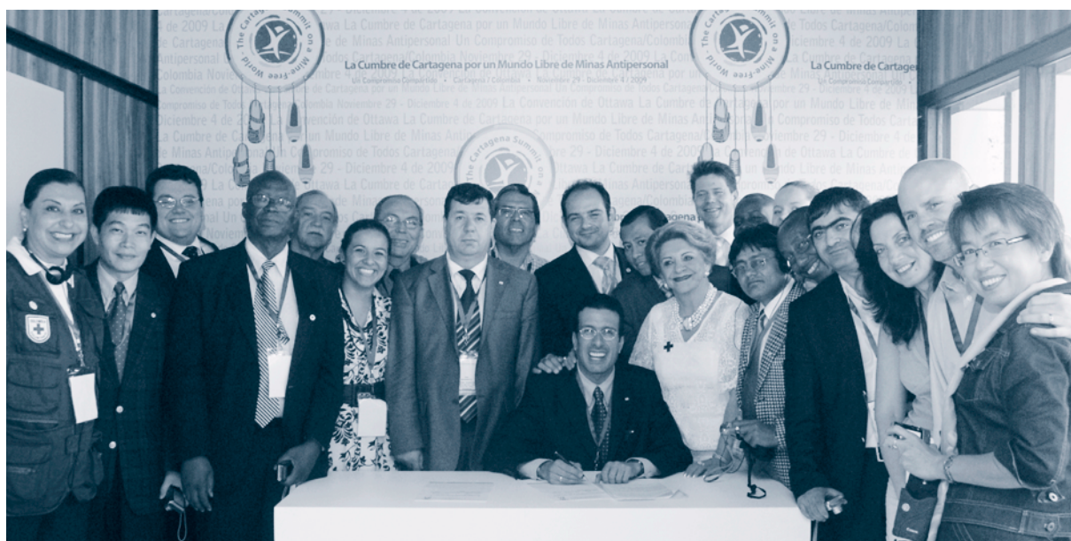
International Federation of the Red Cross and Red Crescent Societies delegates | Cartagena, Colombia | 4 December 2009