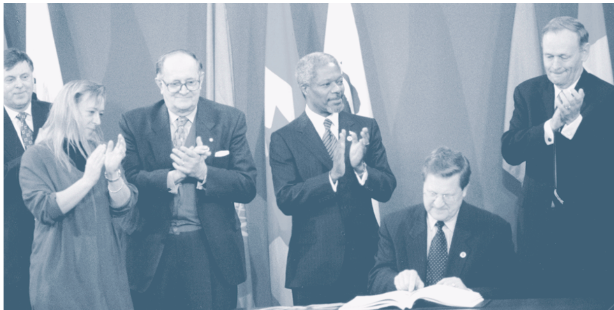
Convention signing ceremony | Ottawa | 3 December 1997

Survivors' needs are being taken seriously. The Convention is the first arms control / disarmament convention that takes their needs into account. Many of the States Parties responsible for significant numbers of survivors have developed objectives and / or a plan of action to meet the needs and guarantee the rights of landmine survivors and other persons with disabilities.