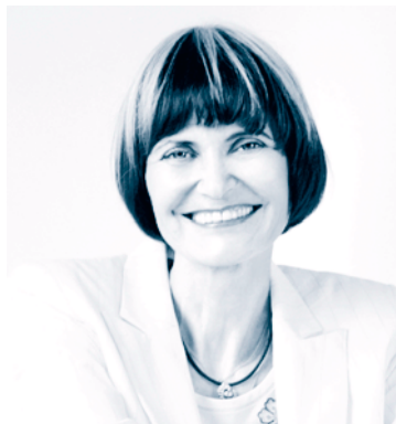
Micheline Calmy-Rey | Minister of Foreign Affairs of Switzerland