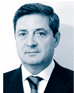
Gazmend Turdiu | Secretary General of the Ministry of Foreign Affairs of the Republic of Albania