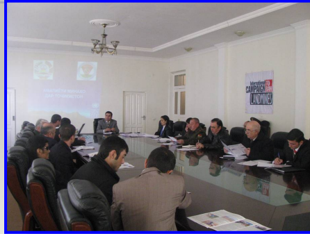
Round Table "World free of mines: Mission is feasible" (February 27, 2009)