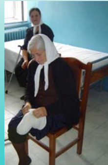
Two landmine survivors at Tropoja Hospital