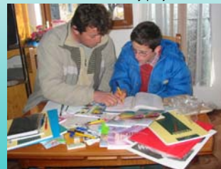
Educational reintegration for child mine survivors