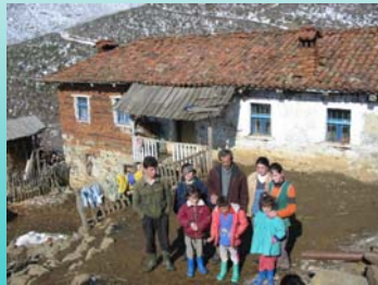
Sight Impaired mine victim and family at home

Landmine/UXO casualties in NE Albania: 238 mine/UXO survivors in Kukes region and 34 dead