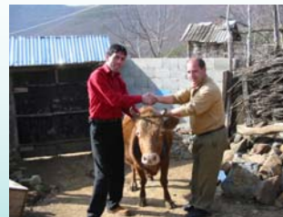
Animal Husbandry project