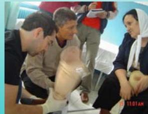
Triage for mine amputees with NOPC and Slovenian Institute