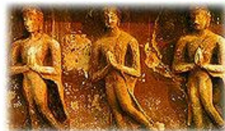
Architectural details of Wat Mahathat at Sukhothai