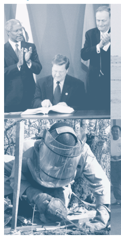
clearing mined areas,