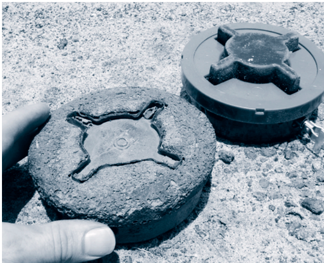
Aging anti-personnel mines