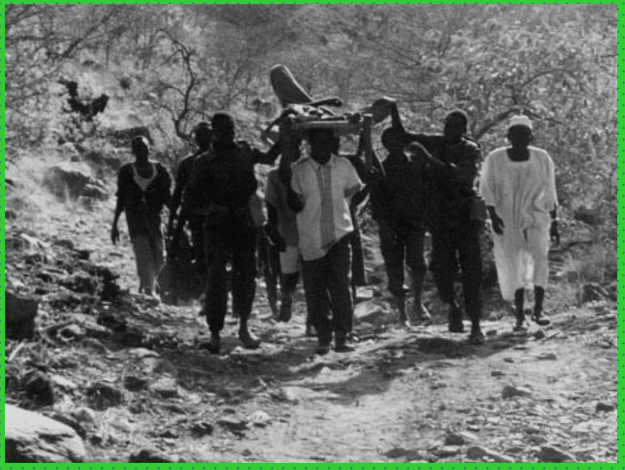
Mine casualty in the Nuba Mountains