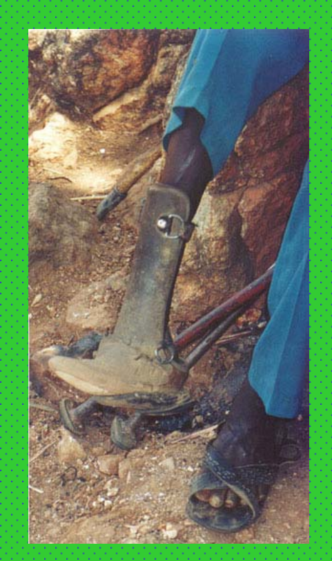
Mine victim in Sudan with makeshift prosthesis