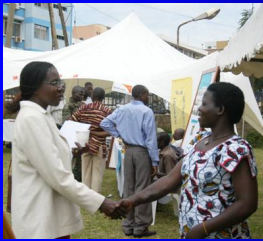
Landmine survivors provided opportunity to speak to Ministers and high level government officials