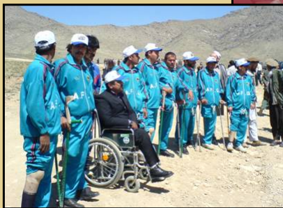
Paralympics Football Team