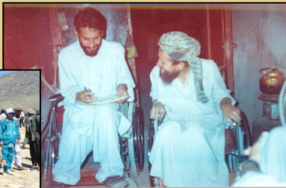
Afghan Disability Union working for all disabled persons