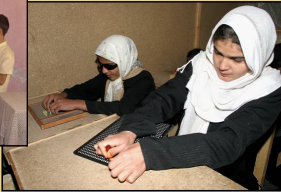
Blind Association Class in Herat City, Western Afghanistan