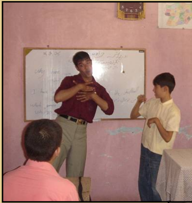
School for the Deaf in Mazar-I-Sharif, Northern Afghanistan