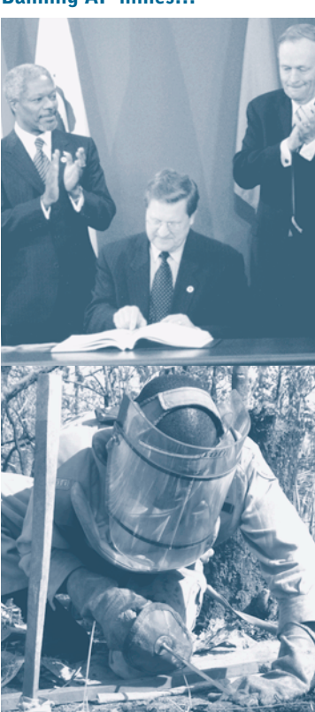
clearing mined areas,