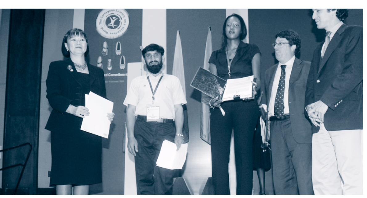
Handover ceremony of the Cartagena Declaration | Cartagena, Colombia | 4 December 2009