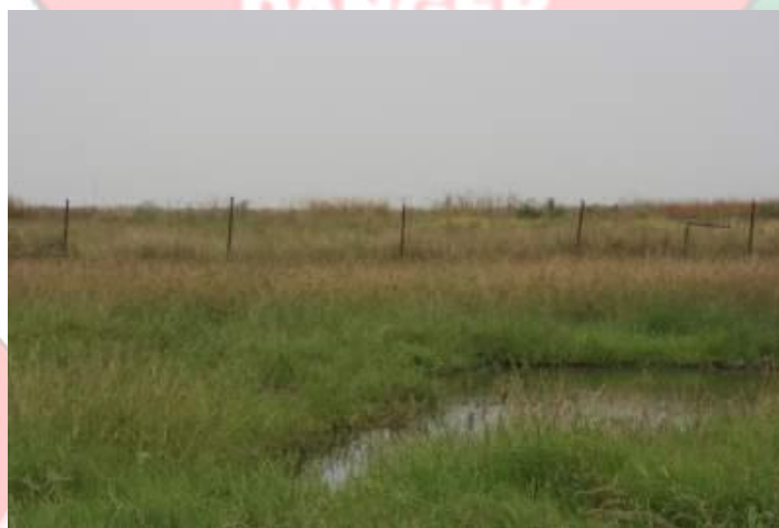
Figure 3 - Looking East