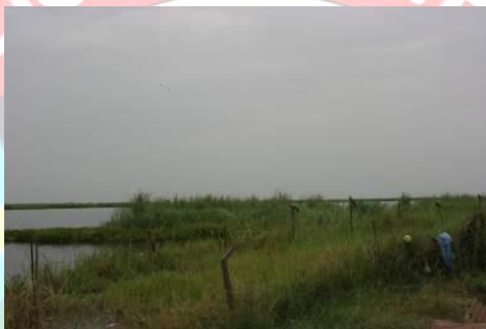
Figure 2 - Looking South to the Sobat River

All three officers stated that they were comfortable walking around any area of the team's choosing as there was no threat of landmines. The investigation team chose to inspect the areas around the SPLA camp as this would be the most likely area to lay landmines. They were accompanied by the three officers and an entourage of approximately 10 soldiers. In the area to the south (Figure 2) was the Sobat River and to the east (Figure 3) and west (Figure 4) were swamp lands created by river overflow. Soldiers were witnessed wading into the water up to waist height to wash and fish. The area was dry to the north (Figure 5) and is in the direction of Nassir, with vegetation burnt to increase visibility for sentries. Cattle/dogs were seen roaming freely in this area as well as soldiers sent out for hunting and firewood collection.