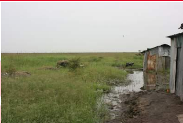
Figure 4 - Looking West