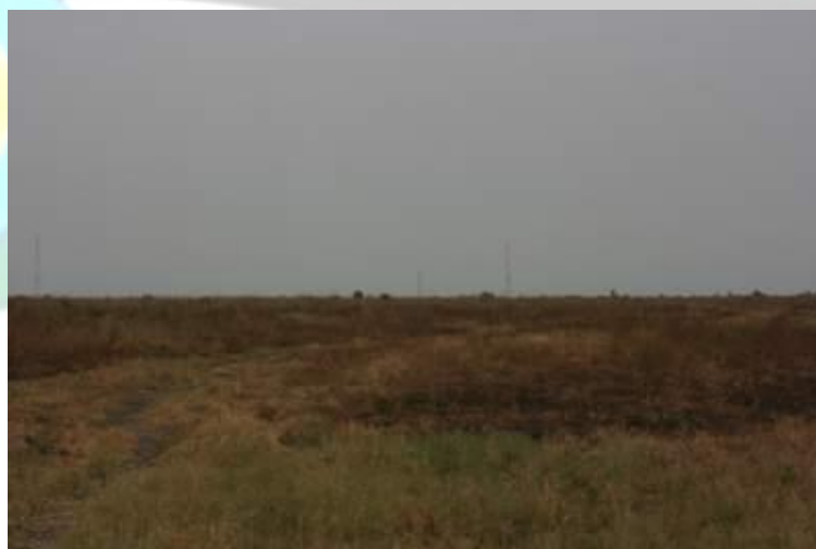
Figure 5 - Looking North

The team asked for the direction of the IO (RM) and were informed that they were on the south side of the river to the southeast and were not in force. The main IO force was many kilometres away.